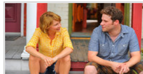
TFF 2012: Spotlight