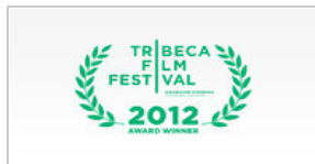
BURN and Any Day Now Win 2012 Heineken Audience Awards!